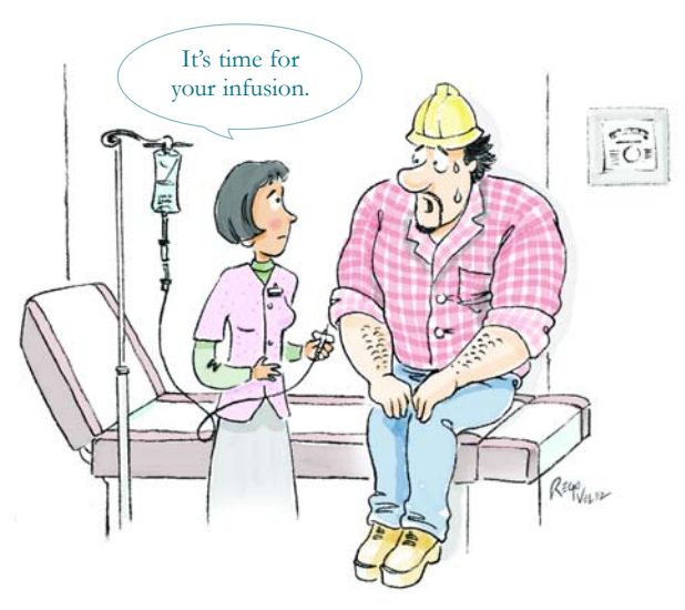
"I'm brave at work, but I'm scared of needles!"

There are ways to make needles less painful and less frightening. Read on to find out more!